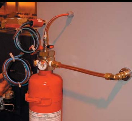
Mounted Firetrace system including pressure switches