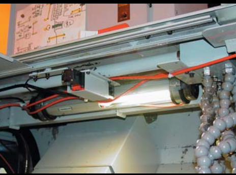
Red Firetrace Detection Tubing run unobtrusively through the working area

Firetrace helps protect your shop, equipment and personnel by quickly and efficiently containing and suppressing the fire. Given what is at stake, can you afford not to protect yourself with Firetrace?