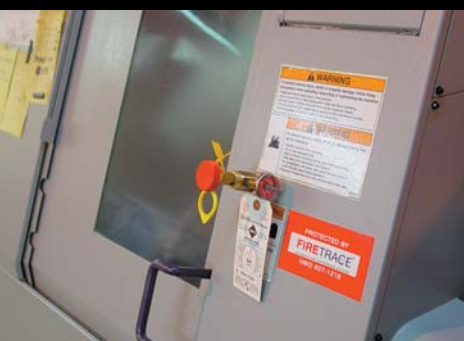
Optional manual release